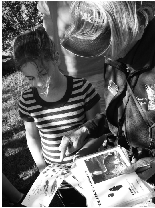
Laguna Docents and students studying animal tracks.

for fall 2011 and spring 2012. So, tell your 2nd-4th grade teacher friends to contact the Laguna Foundation education department so they, too can be included in the call-out for sign-ups.