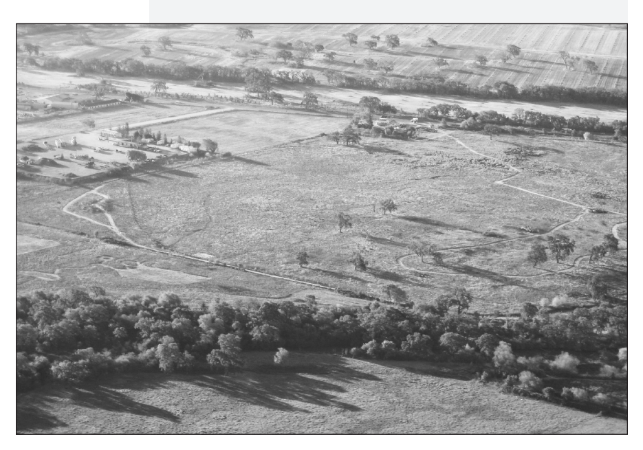
September 2007 aerial photo of Meadowlark Field looking southeast toward Highway 12. This photo was taken prior to the 11-acre planting in the northwest portion of the field. Note the complete lack of woody vegetation throughout the majority of the field.

Once Duer Creek was planted we moved on to the Delta Pond project. After Duer Creek this two-acre site seemed like small potatoes — until we stuck a shovel in the ground! Construction grading and heavy equipment had left the soil compacted and embedded with rocks. We had to rent an auger and hire a posse of strapping young dudes to help us dig a mere 1-1/2 feet down. It took several days, but once the holes were dug the rest went fairly quickly. Students from the Summerfield Waldorf community service program came out to help and got 700 trees planted in three days. The students were a friendly, diligent bunch — veritable poster children for a Waldorf education. It was a pleasure working with them.